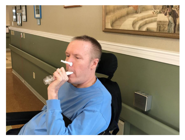
Fig. 1. Participant positioning for inspiratory muscle exercises. Participant performed the exercises using a hand-held inspiratory muscle trainer from a seated position.

the participant's 30% of baseline MIP was below the lowest resistance possible on the IMT device. The resistance of IMT was adjusted weekly based on each participant's baseline MIP, symptoms (e.g. discomfort, shortness of breath, dizziness, or lightheadedness) reported during the week, and tolerance of the exercise evaluated by Borg Rate of Perceived Exertion (RPE) on the last day of the week (Borg, 1982).