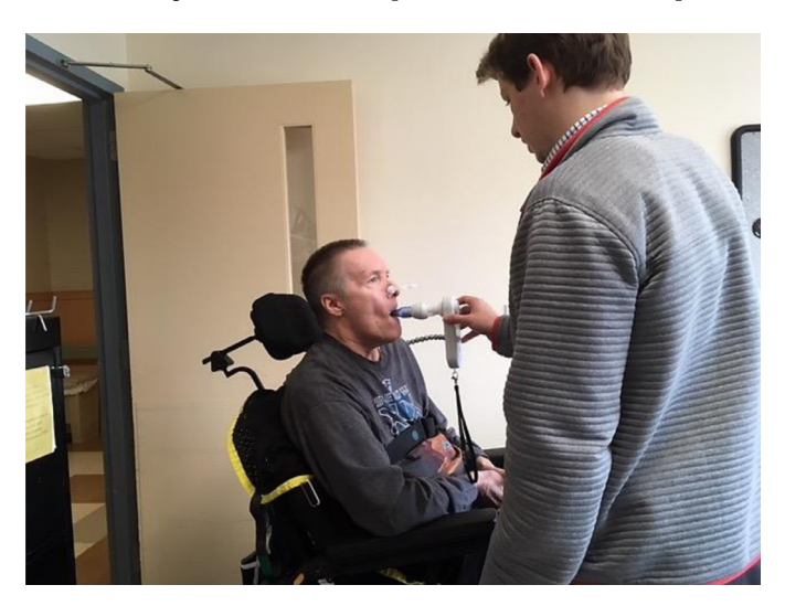
Fig. 2. Participant positioning and equipment for maximum inspiratory and expiratory pressure testing.

A MicroRPM Pressure Meter (Micro Direct, Inc. Lewiston, ME)<sup>b</sup> was used to measure MIP and MEP five times in the study: prior to the start of IMT training (baseline), after 5 (post-test 1) and 10 weeks (post-test